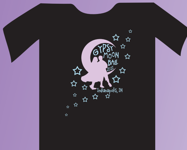
Black shirt with blue & purple design.